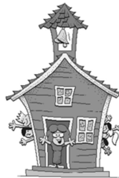
Not all students at L.A. High feel safe in school.