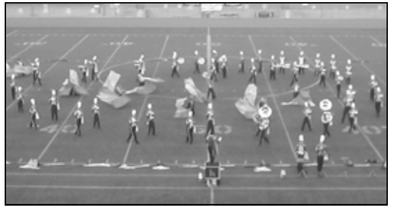
The band and color guard performed at East L.A. City College in the City Championships this past weekend.

Congratulations to our Band and Color Guard. Now lets see if they can go for their 16th consecutive championship.