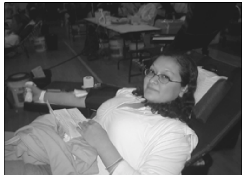
About 230 students and faculty participated in the Blood Drive, which took place on November 30. Just recently L.A. High received the "Teresa Del Rio Award" for being the most improved school in blood donations.

If you have any questions about donating blood, or are interested in doing so, please contact the Red Cross.