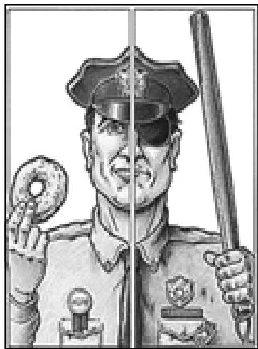
Some students feel they don't get respect from cops.

He says that sometimes cops don't even pay attention to what