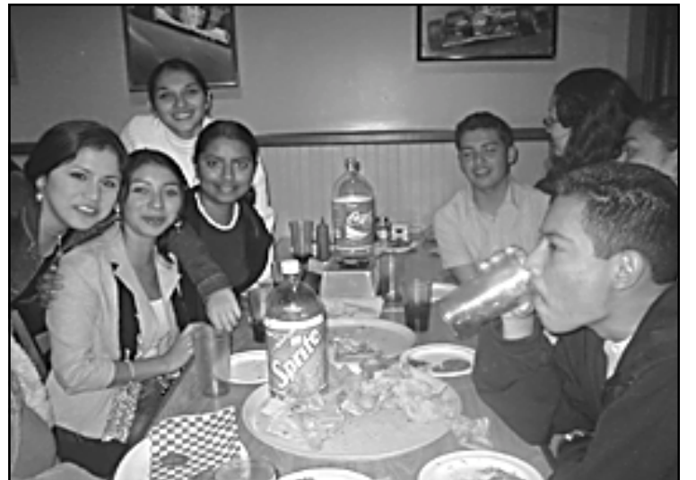
Students enjoy the greasy pizza in support of Senior Council.

The whole purpose of the date auctioning was for a person who was getting "sold" to go up to the mini stage, and have people in the audience give money to go on a date with him or her. Whoever gave the most money for the date automatically won, and had to pay the money they were offering. Sounds like something fun and exciting. So next time you hear about a Shakey's Night, make sure you save up money and attend. There's always fun, food, and games for you to entertain yourself if your friends or partners just aren't enough.