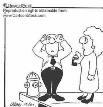
The cartoon demonstrates the effect of pepper spray in a comical way.

students that were interviewed also agree that they shouldn't be allowed to carry pepper spray because it's also not safe for them.